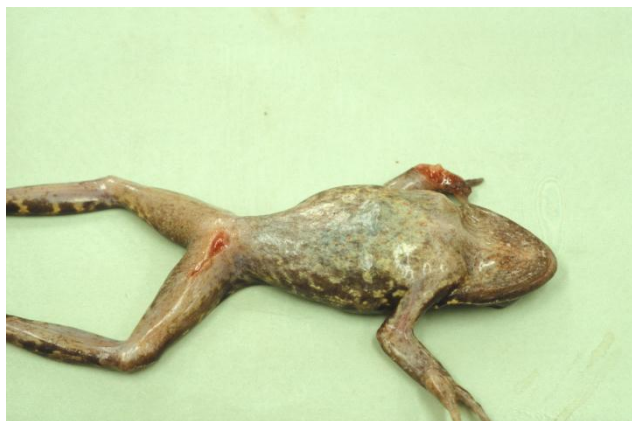
Figure 1. Common frog ( R. temporaria ) with ranavirus disease showing skin ulceration and loss of digits.

Ranavirus disease outbreaks can vary from numerous dead amphibians visible in, and surrounding, water bodies to individual sick animals seen. Affected adult amphibians may have reddening of the skin, skin ulceration, bloody mucus in the mouth and might pass blood from the rectum; often there is internal bleeding (which is detected on post-mortem examination). Often, large numbers of dead animals are found with no evidence of disease, but these animals invariably have died of internal bleeding. Individual sick animals usually are lethargic and have skin ulceration or loss of digits (fingers and toes), which sometimes progresses to loss of entire feet (Figure 1).